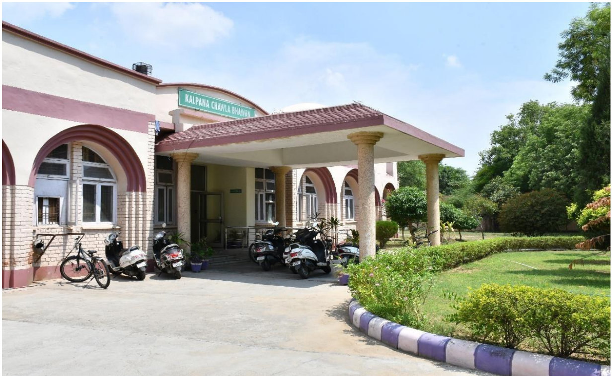
Kalpana Chawla Bhawan (Working Women Hostel)