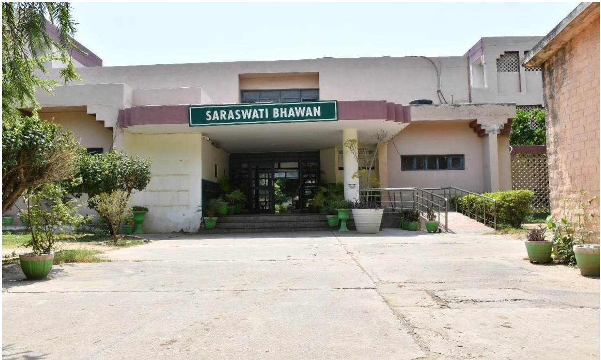
Saraswati Bhawan (Girls Hostel-II)