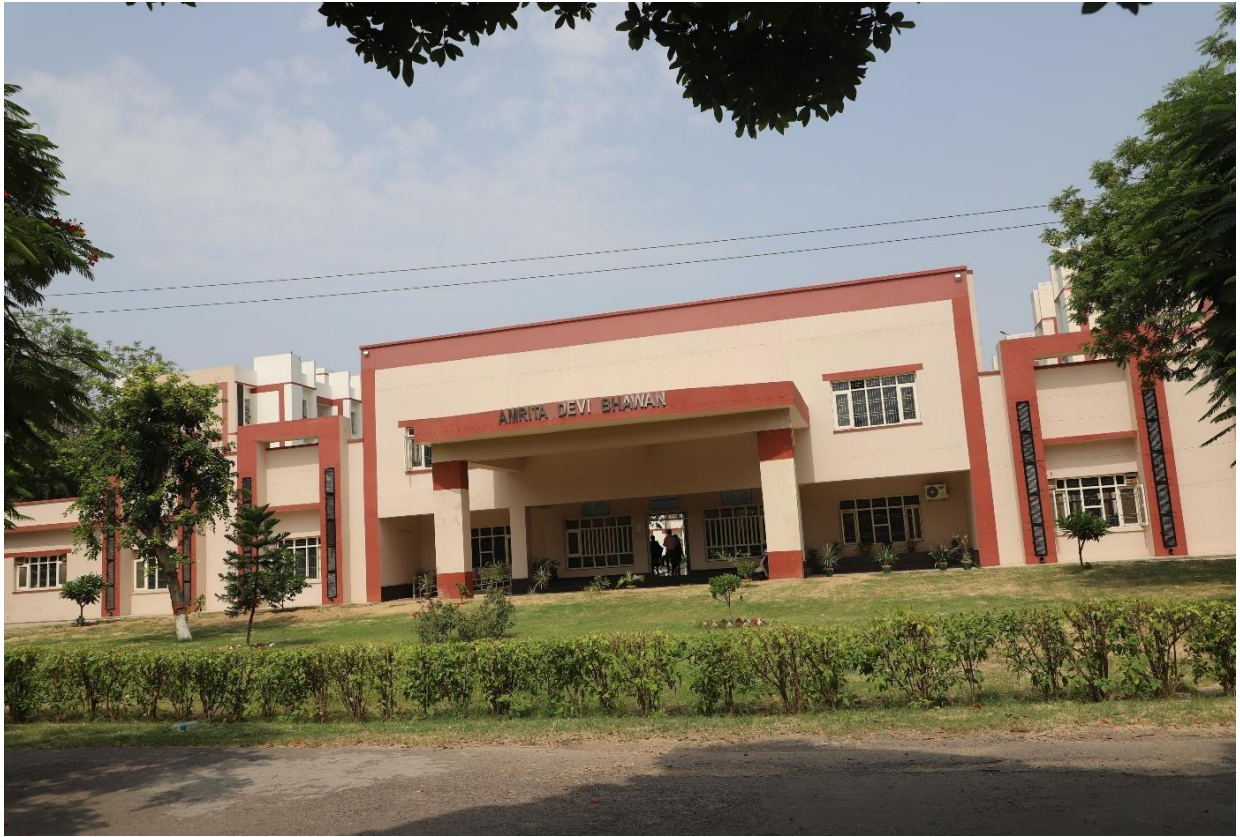
Amrita Devi Bhawan (Girls Hostel –IV)