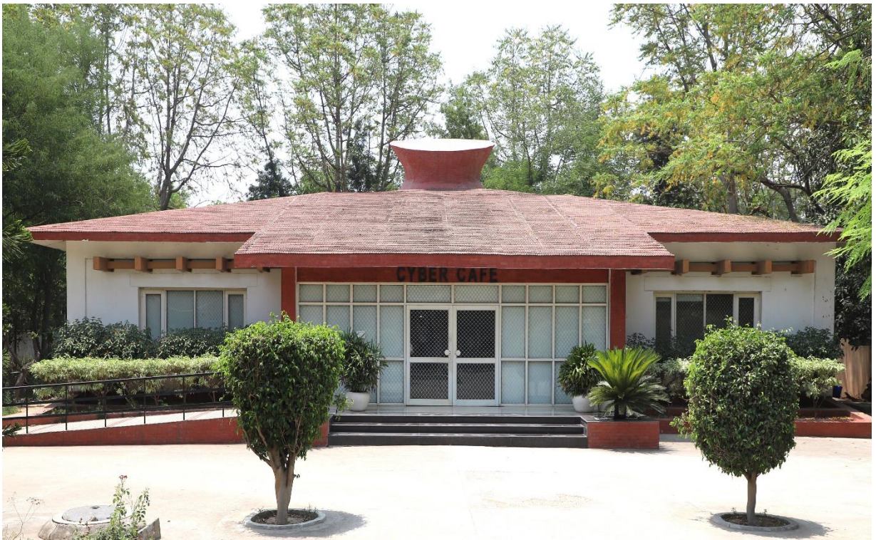
Cyber Lab (Girls Hostel Complex)