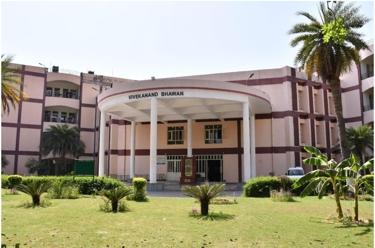
Vivekanand Bhawan (Boys Hostel-IV)