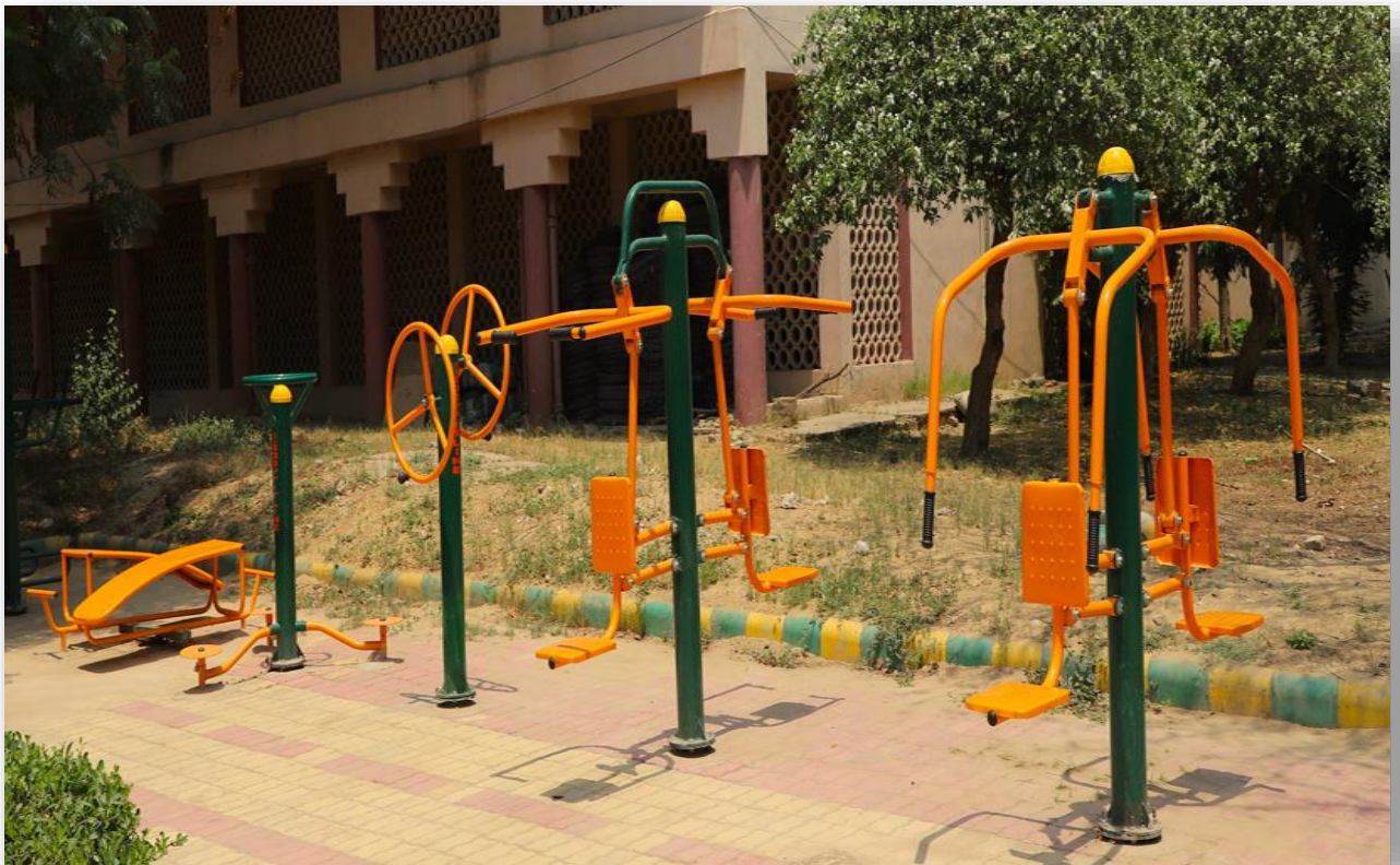
Open Air Gym (Girls Hostel Complex)