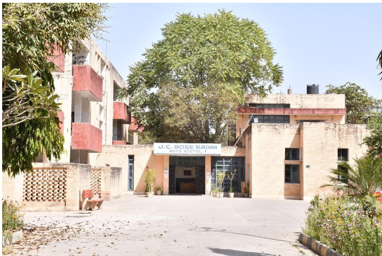
J.C. Bose Sadan (Boys Hostel-I)

The meal is provided as per healthy & balanced menu at reasonable rates and menu items & quality check is done randomly by the Mess Committees, Wardens, Coordinators, Deputy Chief Wardens and the Chief Wardens. Hostel accommodation will be provided according to latest hostel rules. The prospective hostellers are also required to submit medical fitness certificate at the time of admission. The hostel residents are governed by the terms and conditions as contained in the University Hostel Regulations. The university administration with the very energetic and dedicated team of hostel administrations ensures a better quality of life for all the hostel residents.