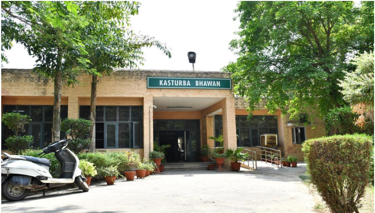
Kasturba Bhawan (Girls Hostel-I)