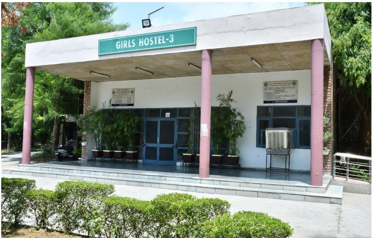
Manikarnika Bhawan (Girls Hostel-III)