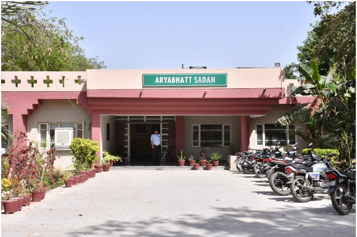
Aryabhata Sadan (Boys Hostel-II)