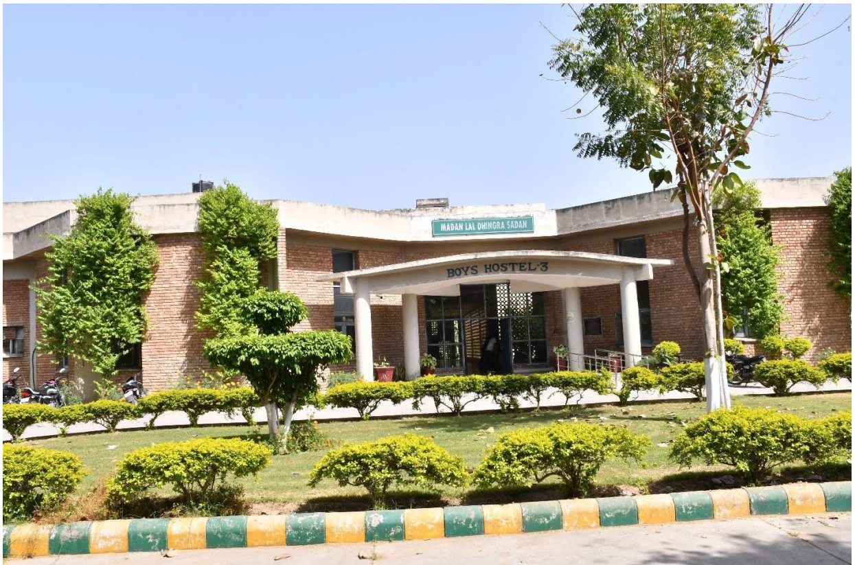
Madan Lal Dhirgira Sadan (Boys Hostel-III)